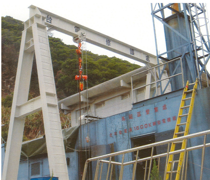
Diesel power overhead crane : ZINGA