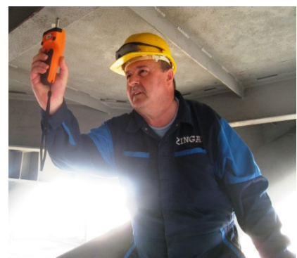
Right: Surface inspection